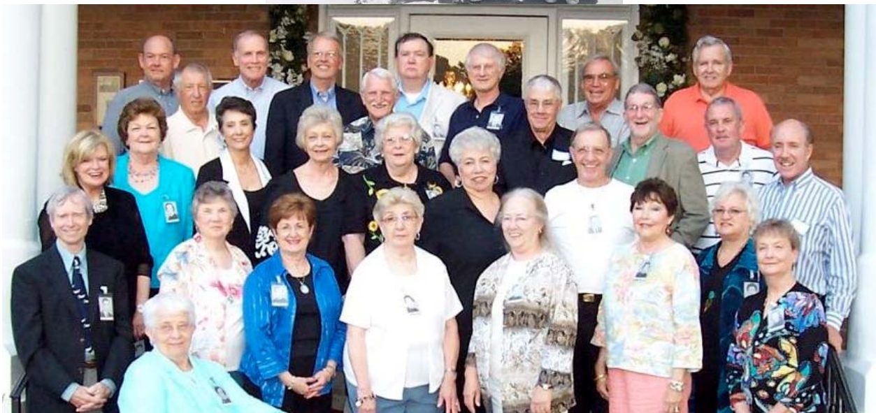
Class of 1958 at their recent 50 Year Class Reunion